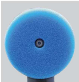
Foam polishing pad alignement