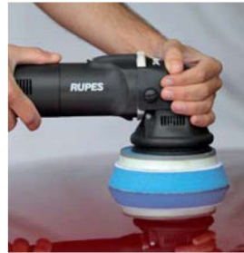
Keep the tool flat and without additional load